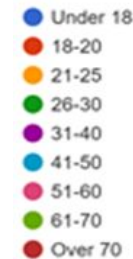
How old are you 87 responses