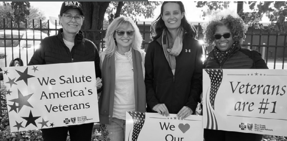
Members of the Veterans ERN recognize Veterans Day as participants of the Veterans Day Parade held in Detroit.

5,161 in overall employee resource network membership; 2,379 unique members, representing 32% of employees participating (This is above the national standard 27% benchmark for companies with ERN programs.)