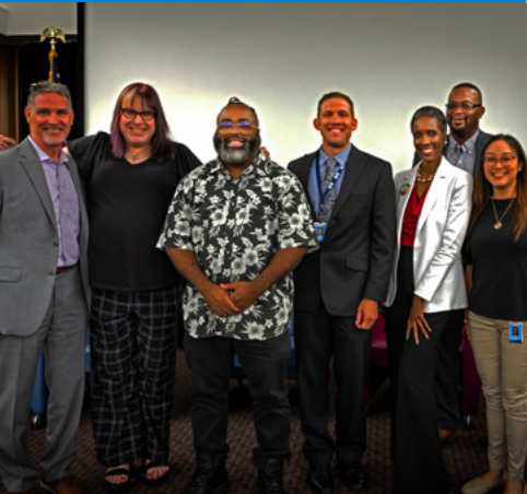
Panel members share their stories during the kickoff event.