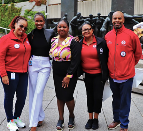
Employees join to "Build Culture Together" during the Celebrate Diversity! culminating event.

Each year in August, Celebrate Diversity! is held to recognize the richness of our workplace culture. It starts with a kickoff session featuring a question-and-answer segment with Blue Cross' president and CEO, and ends with an in-person culminating event that brings employees together at various office sites.