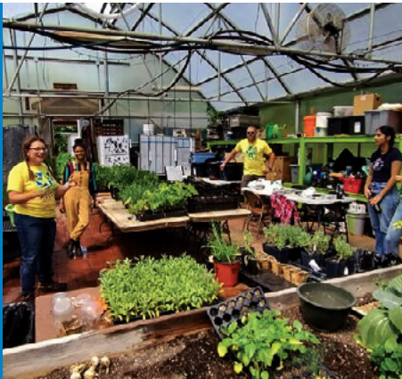
Interns volunteering at the Allen Neighborhood Center.

Skills such as empathy and listening are crucial in today's workplace communities. Through experiential community service and projects, interns have the opportunity to learn about different people, experiences and perspectives. In 2023, 100 interns participated in four Inclusion and Diversity community intern project teams. Blue Cross partnered with four nonprofit organizations – Corktown Health, The Senior Alliance, Allen Neighborhood Center and Cristo Rey Community Center – to address a business need. There was also a fifth intern project – the internal Intern Engagement team – that provided an opportunity for interns who were interested in event planning to learn new skills. The Young Professionals employee resource network also implemented the Mentor Me reciprocal mentoring program with 121 intern participants.