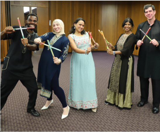
As part of Celebrate Diversity!, employees learned about dances from around the world, including the Indian dance styles Dandiya/Garba and Bhangra.